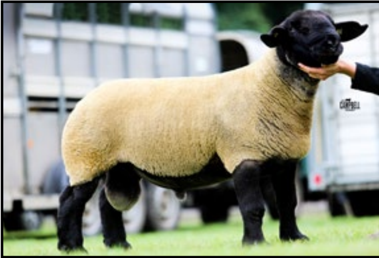
Brijon Class Act

All Gimmers have been vaccinated for Enzo and Toxo .