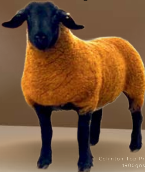
Cairnton Top Price Ewe Lamb 1900gns 2023

Lanark Agricultural Centre Muirglen, Hyndford Road, Lanark, ML11 9AX