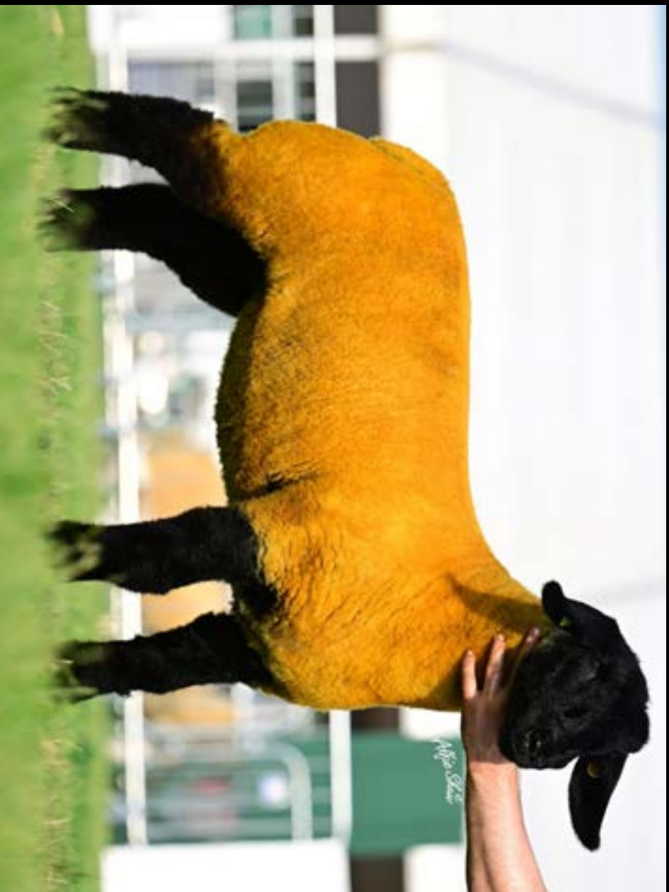
NI FEMALE OF THE YEAR – SISTER TO LOT 66