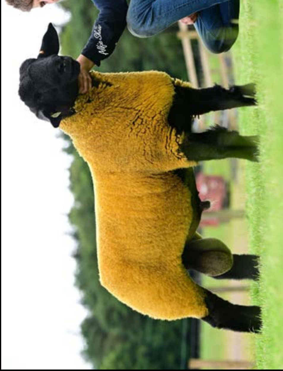
MAIDENSTONE – 15,000GNS